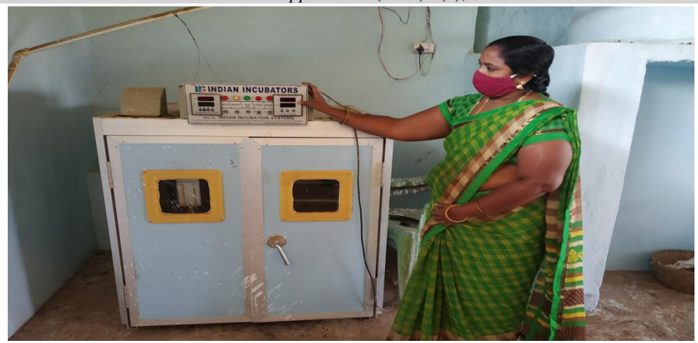
Illustration5. upgraded the backyard poultry by establishing incubator