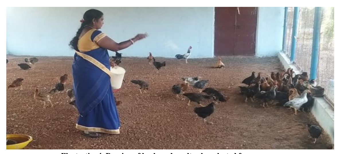
Illustration4. Rearing of backyard poultry by selected farm women

women, lactating mothers and children. The results in these backyard farming efforts leads to a sustainable and regular to the women families there by increasing the rural economy. This kind of enterprise paves the way for the up-liftment of a section of the community in the state besides it facilitate production of adequate quality egg and meat in the state.